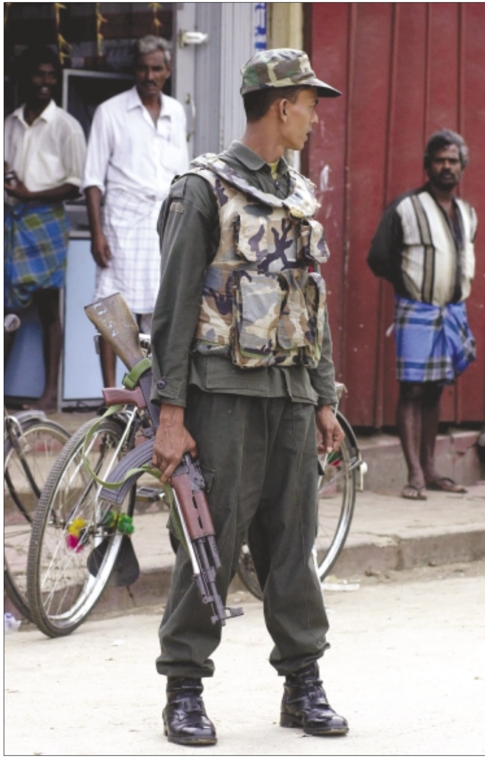
SLA troops are resisting ceasefire rules on withdrawals from public places

The cease-fire agreement had to be fully implemented before peace talks went ahead in Thailand, the LTTE