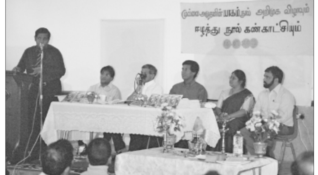
The launch of 'Yaham', a compilation of poems written by Eelam Tamil poet Mullai Amuthan, was held on 14 July in East Ham, London. The launch was organised by the 'Katraveli' magazine. An exhibition of thousands of Tamils books and others written by Tamil authors preceded the launch.