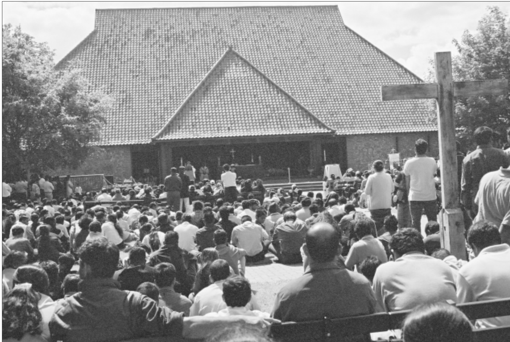
Over five thousand people from Britain's expatriate Tamil community headed for the Norfolk town of Little Walsingham in an annual pilgrimage Sunday before last. A day of prayers and reflection began at midday with the procession of the Lady of Walsingham. The worshippers then gathered in the front courtyard of Our Lady of Walsingham shrine (pictured) to listen to prayers, conducted mainly in Tamil. Two collections were made at the end of the mass, one for the church itself and the other for the four Tamil dioceses of Jaffna, Trincomalee, Mannar and Batticaloa. The huge gathering then had lunch on the greens of the church. A benediction ceremony followed at four in the afternoon.