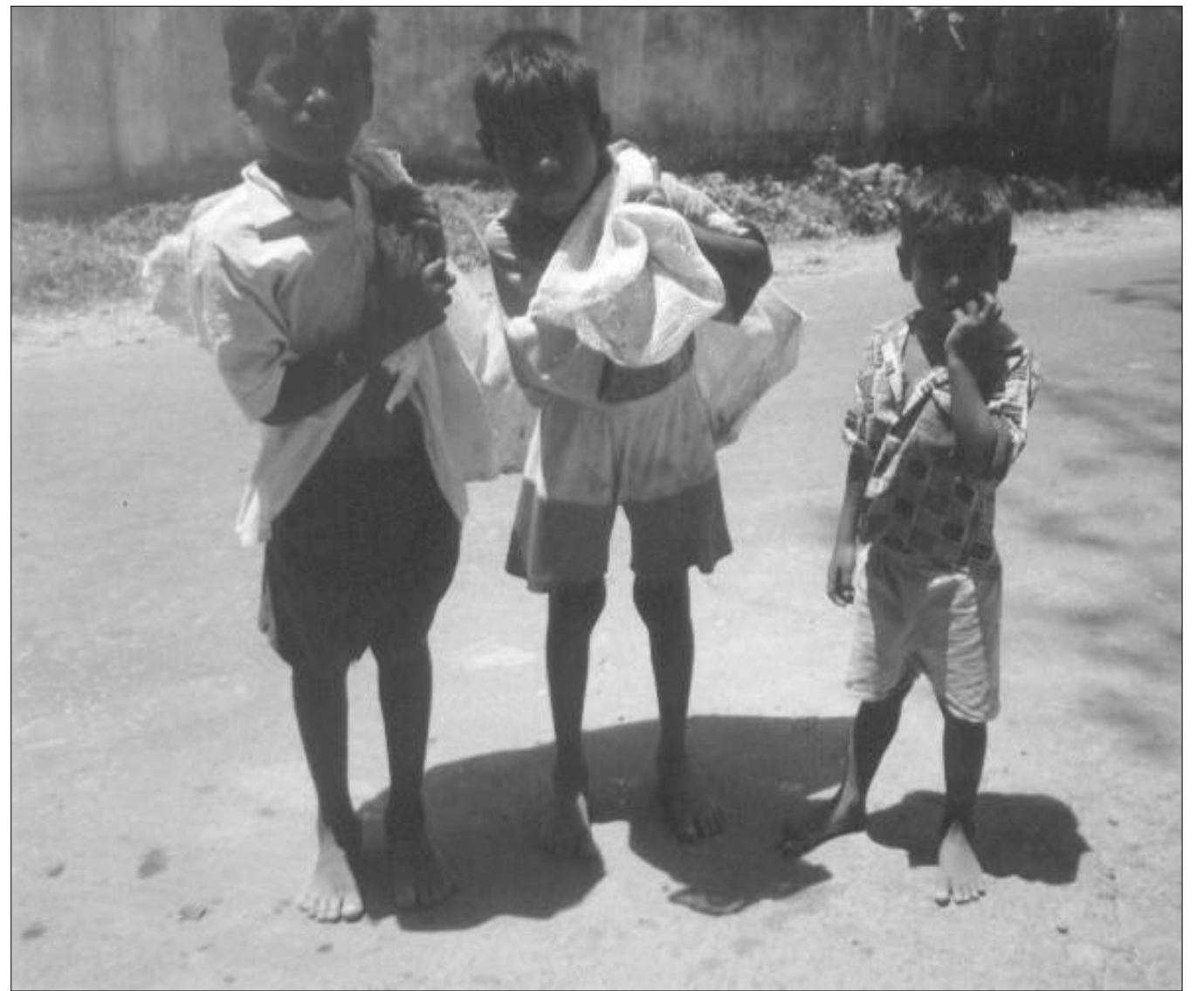
Respite: Three Tamil children on their way home from collecting relief supplies from aid workers. An estimated four hundred thousand Tamils in the Vanni live under an economic blockade imposed by the Sri Lankan government.

Manmunai is on the eastern coast of the Batticaloa lagoon. Ferry service from Manmunai connects Kokkaddicholai, a large village in the western hinterland which is under the control of the Liberation Tigers. The ferry carries the greater part of the traffic to and from the western shore (Paduvaankarai).