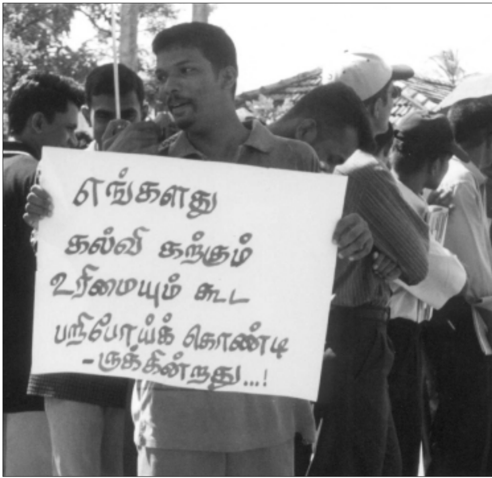
Eastern University students decry the government's denial of the right to education

"It is untrue of Uthayan to claim that the students refused to have a meeting with Minister Douglas Devananda. The minister never invited any representative of the Jaffna University Students Union to discuss the situation with the university. We emphasise this", the paramilitary group which conducts counterinsurgency alongside the Sri Lanka Army (SLA) said in a statement. However, the EPDP's statement has been categorically rejected by Uthayan's editor on the 20 July issue. "We insist that [our] story